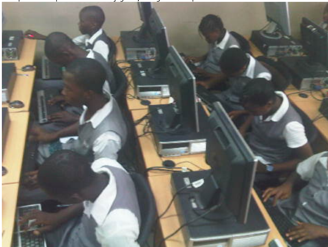
Bequest College Students during the ICT workshop organized by PIN

PIN also invited the students of Bequest College, a secondary school in Ajegunle, for a two-day workshop at the Centre. Like most schools in Ajegunle, they were missing a computer laboratory at the school. The workshop introduced the young minds to careers in technology and gave them a general knowledge of the use of computers and the Internet. There was time for guided practice and it was the first time many of the students had access to use a computer. PIN intends to continue this exercise with both private and public schools in Ajegunle, though with emphasis on the latter.