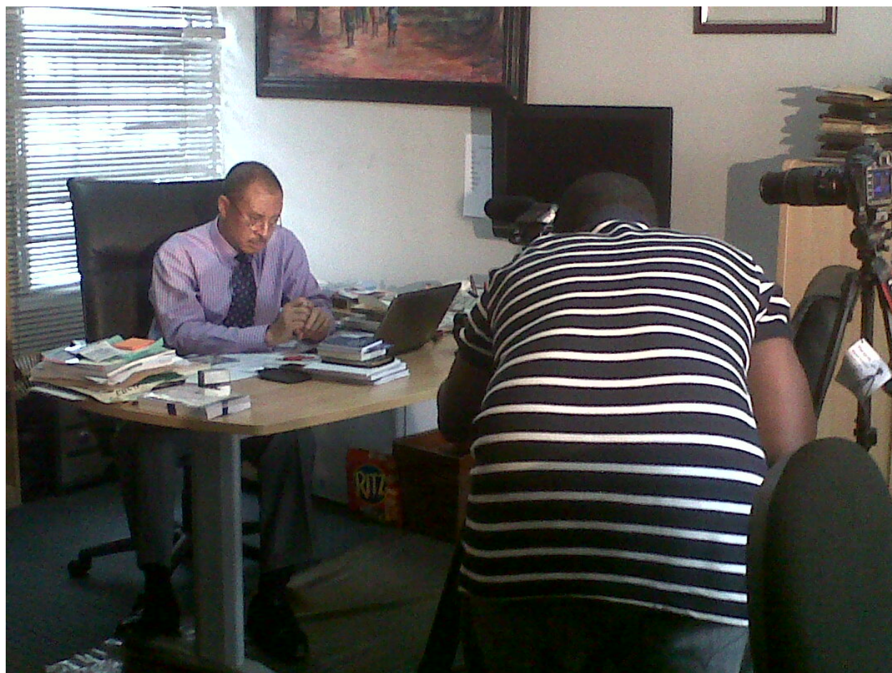
MISSPIN Documentary Shoot with Professor Pat Utomi

The Microsoft Internet and Safety Security Privacy Initiative of Nigeria (MISSPIN) project witnessed some milestones in the quarter. A documentary addressing the economic cost of cybercrime in Nigeria, produced by Paradigm Initiative Nigeria and supported by Microsoft TrustWorthy Computing, revealed shocking details and also engaged experts in vibrant discussions about the journey towards a fair and firm cybercrime legislation in Nigeria so far. The documentary raised succinct issues and offered recommendations. You can watch excerpts of the documentary on PIN's YouTube channel, www.youtube.com/pinigeria . We will make DVD copies available to legislators, partners and other stakeholders in April 2013.