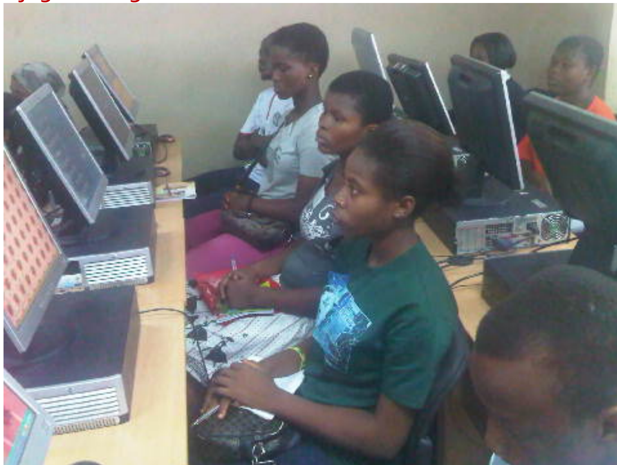
Class of 2013A: The First Day of School