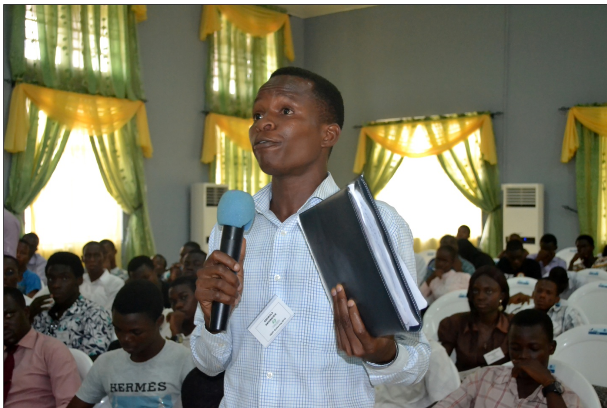
A participating student asking facilitators questions, at TENT Gathering 2012