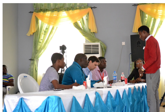
A student pitching his idea to the panel day Day 3