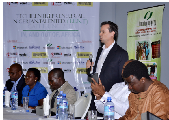
Keynote speakers at TENT Gathering 2012