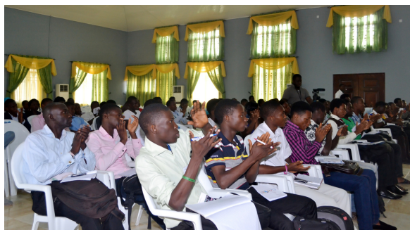
Cross Section of Participants at TENT Gathering