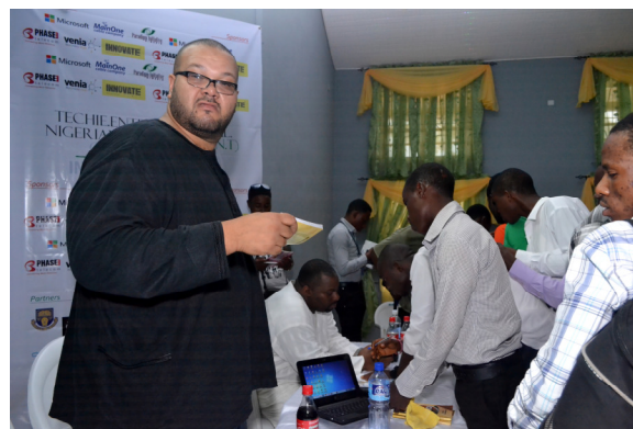
Speakers with students Day 2 of TENT Gathering