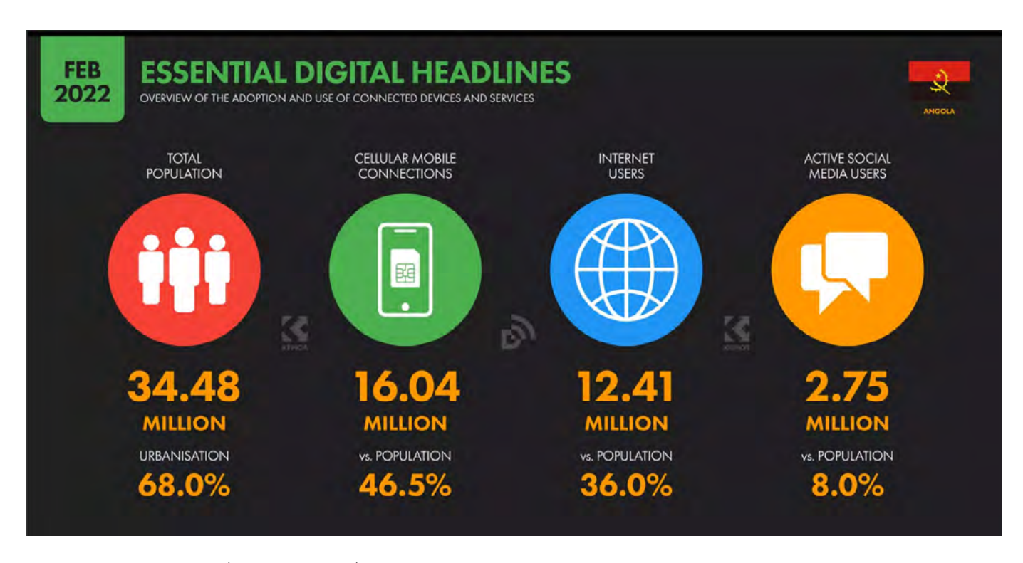
Figure 1: Digital in Angola (Hootsuite, 2022)