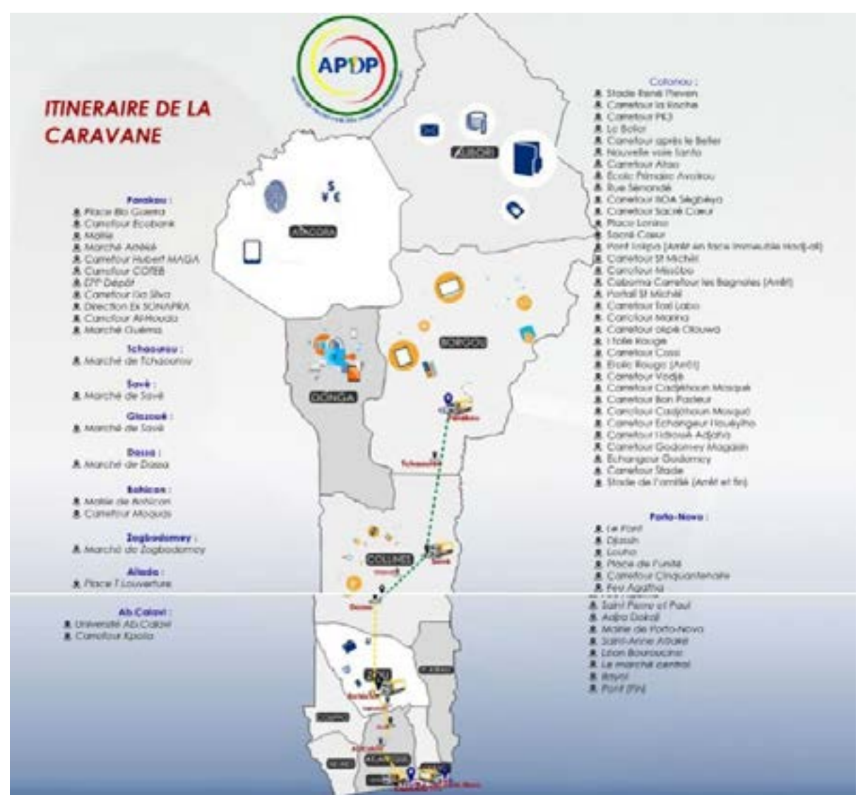
Figure 1: Travelling exhibition organised by the Benin Data Protection Authority to raise awareness on Data Protection Day.

When it comes to data protection, Benin has been one of Africa's front-runners in this field. The data protection regime in Benin is governed by two pieces of legislation namely the Law No. 2017-20 of April 20, 2018 of the Digital Code and the Law No. 2009-09 of May 22, 2009 dealing with the Protection of Personally Identifiable Information. Each year on 28 January, Benin celebrates the Data Protection day<sup>57</sup>. On the 18th edition of the event this year, the Data Protection Authority invited internet users to reflect on their relationship with technology and to apply good practices to protect their personal data<sup>58</sup>.